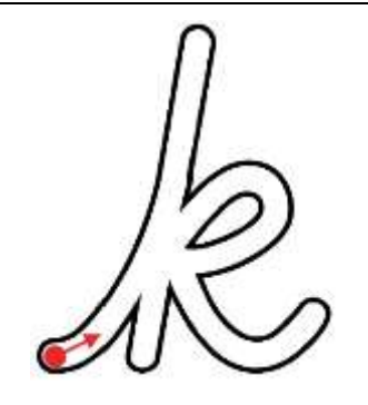
Up we go... down the kangaroo's body, tail and leg... and off we go